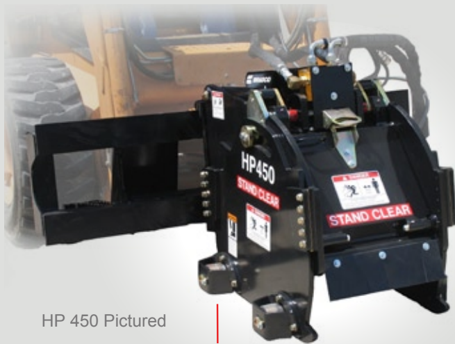
HP 450 Pictured

Wheels are removable for planing ne to curbs or other obstructions